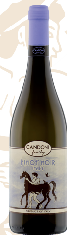
PINOT NOIR I.G.P. PAVIA LOMBARDY

Semi-sparkling, low in alcohol. Very fruity and fragrant with an excellent balance of sweetness and acidity. Serve chilled.