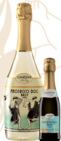
PROSECCO BRUT DOC VENETO

Sparkling, crisp, and clean. Well-balanced taste. Delicate and fruity with a hint of honey. Serve well-chilled.