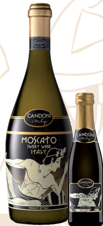
MOSCATO I.G.P. PAVIA LOMBARDY

Sparkling, crisp, and clean. Well-balanced taste. Delicate and fruity with a hint of honey. Serve well-chilled.